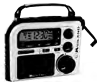
Emergency Crank Radios