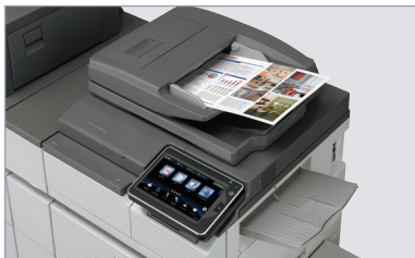
Single pass, dual side scanning at up to 200 IPM