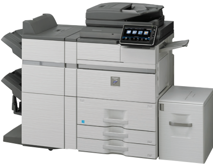
MX-M754N shown with options.