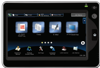
Tablet-style touch-screen display with intuitive menu navigation.

The Sharp MX-M654N and M754N monochrome workgroup document systems deliver high productivity and strong versatility.