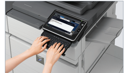
Standard retractable keyboard simplifies data entry