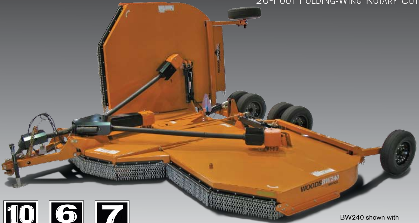
BW240 shown with chain shielding.