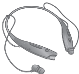
LG TONE+™ HBS-730