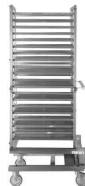
ROLL-IN PAN CART