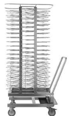
ROLL-IN PLATE CART