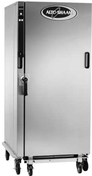
MODEL 20•20MW (SHOWN WITH RIGHT-HAND DOOR)