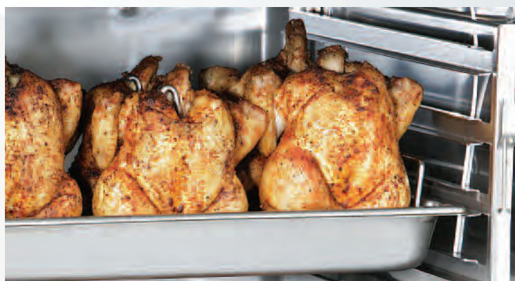
Gold-n-Brown™ makes it easy to brown food and achieve a crispy texture – without the use of unhealthy fats or oils.