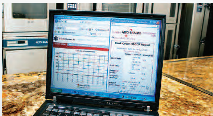
HACCP documentation is displayed in a detailed overview for evaluation and printing.