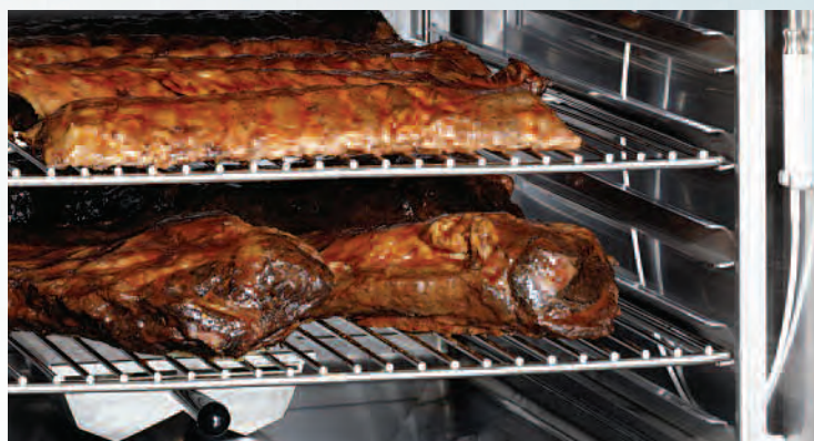
Smoke any food item – hot or cold – with the patented Combitherm Smoker.

With HACCP/Kitchen Management software you can now manage multiple pieces of equipment in the fully integrated kitchen. Plus, the software offers full NAFEM Data Protocol compliance with real time data transfer and automated logging. Wireless option is also available.