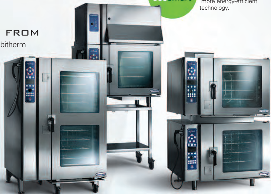
All Combitherm ovens are designed and built in the U.S.A.

EcoSmart™ products demonstrate our commitment to greener, more energy-efficient technology.