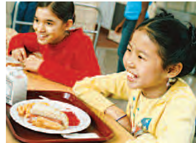
School and University