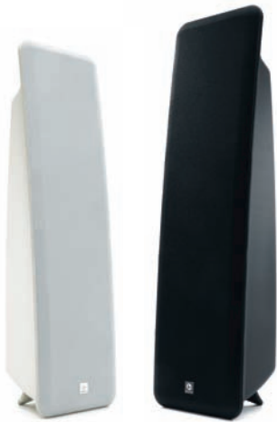
(Left) HS 450 in mist with Silver grille (Right) HS 460 in Midnight with Onyx grille