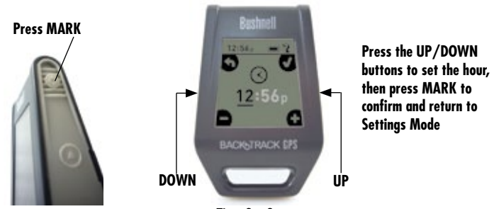
Time Set Screen

The Location screen will display when first turned on. The time is displayed but may need to be adjusted for your time zone. Go to Settings Mode to change the time (as well as other units of measurement). Press UP button on right side of unit to access Settings Mode.