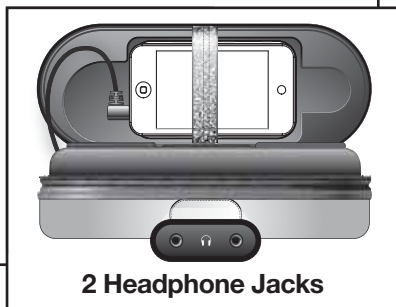
2 Headphone Jacks