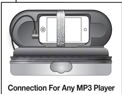
Connection For Any MP3 Player